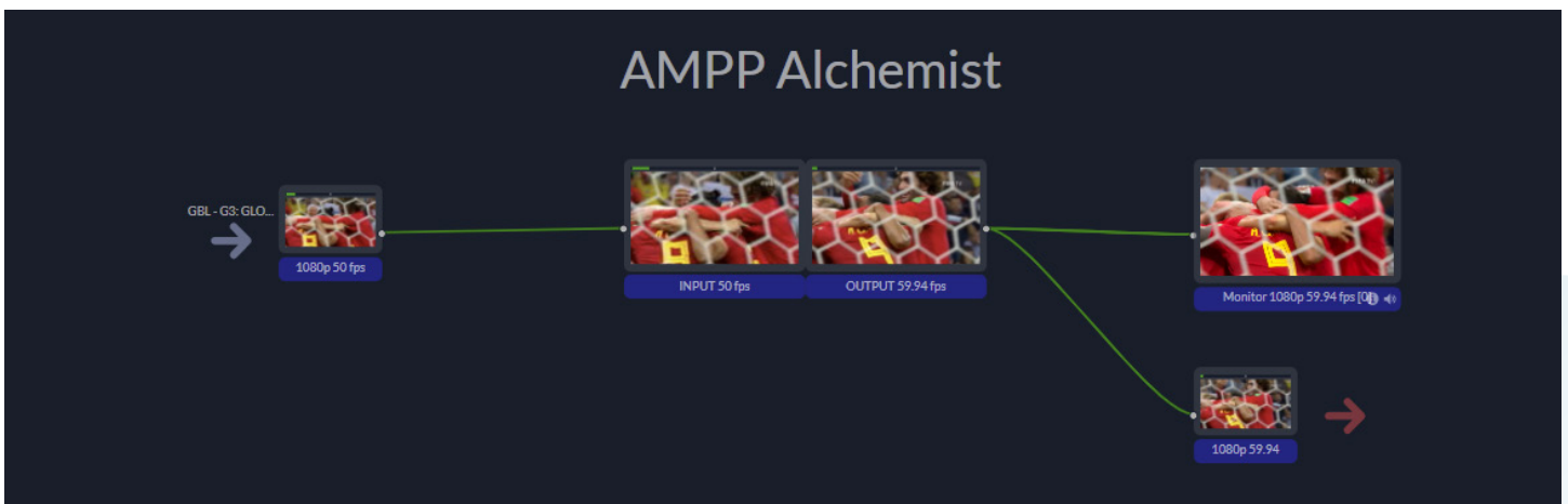
AMPP Alchemist workflow